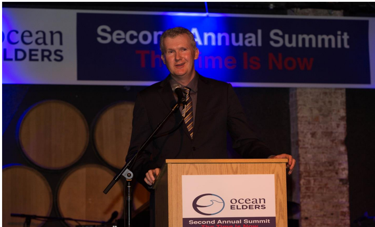
The Hon Tony Burke, MP at the 2014 Ocean Elders Summit in New York City

-The Hon Tony Burke, MP, Former Minister for Sustainability, Environment, Water, Population and Communities, Australia