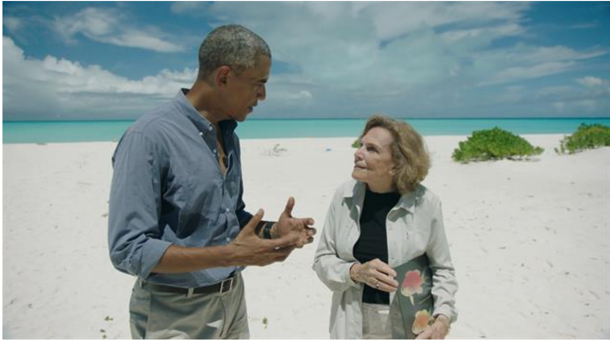
President Barack Obama and Ocean Elder Dr. Sylvia Earle on Midway Atoll, September 2016