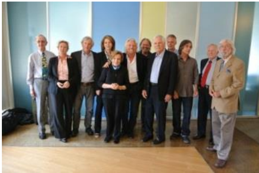
Ocean Elders Meeting - May 4, 2012 - New York City