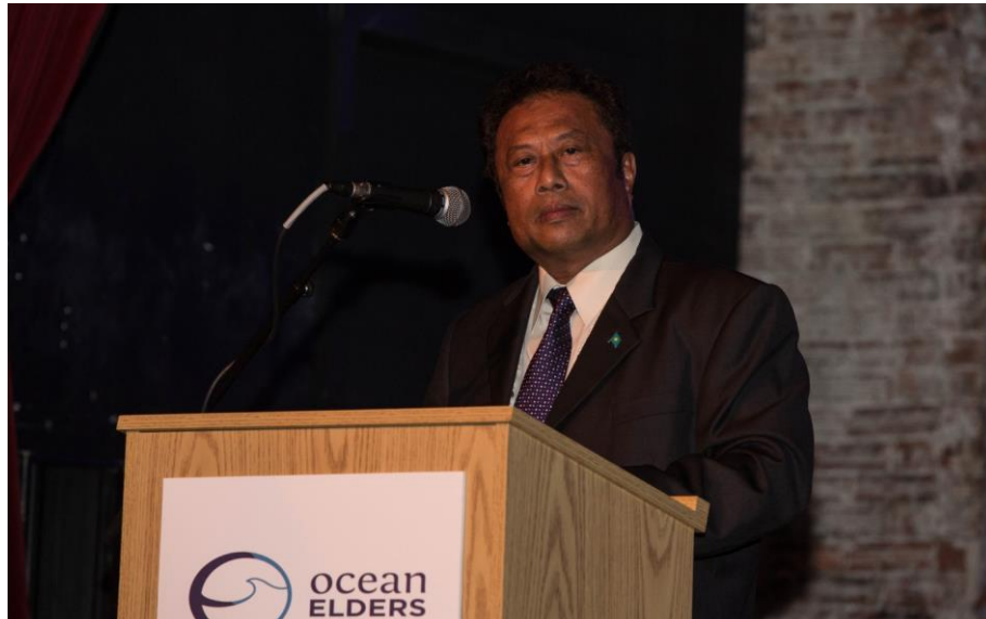
Palau President Tommy Remengesau, Jr. at the 2014 Ocean Elders Summit in New York City

Palau: Although members of Ocean Elders already enjoyed a strong bond, in June 2013 we were formally introduced to Palau President Tommy Remengesau, Jr. at the Monaco Blue Initiative, an annual conference hosted by HSH Prince Albert II. At the time, President Tommy was already leading ocean efforts with the powerful idea of protecting up to 80% of Palau’s waters from any extractive activities, and closing off the remainder to foreign commercial fleets. He and South Pacific island leader Anote Tong, then President of Kiribati, were vocal advocates for the protection of the ocean. They understood the impacts of climate change and the declining ocean health on their small island nations, as these nearly sea level islands were on the front line. These two leaders received the Ocean Elders Ocean Leadership Awards at our Ocean Elders Ocean Summit in September 2014. In February of 2015, Ocean Elders sent letters to senators in Palau, urging them to support their president’s push to establish the sanctuary. In October 2015, the Palau National Marine Sanctuary was announced, the 6 th largest fully protected marine area in the world, thereby protecting more than 1300 species of fish and 700 species of coral.