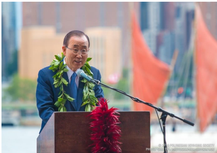
UN Secretary-General Ban Ki-moon welcomes Hōkūleʻa to New York City - June 8, 2016

In March 2016, Sir Richard Branson welcomed Hōkūleʻa and her crew to the British Virgin Islands and shared discussions of ways to protect the ocean with local students, teachers, and officials as well as non-profit leaders. Additionally, members of our team have supported PVS on its sail around the world, in many ports of many countries, and were present to help highlight June 8 th , 2016, World Oceans Day, in NYC as Hōkūleʻa sailed by the United Nations with a warm welcome from the UN Secretary-General.